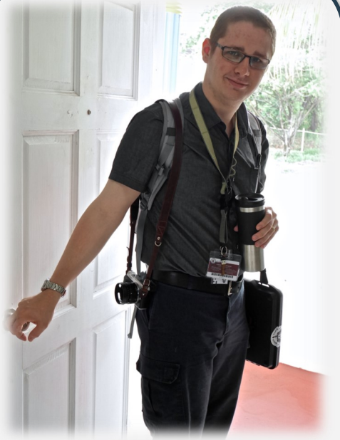
Going out the door for the first day of med school.

The White Coat Ceremony is the official induction of new medical students by high-standing professionals into their field of study. The white coat is a symbol of the tremendous responsibility that the student accepts with becoming a professional in their industry.