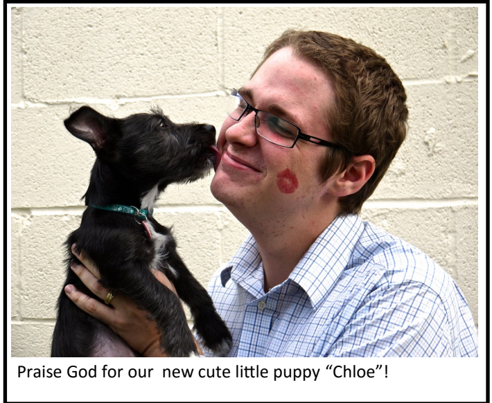
Praise God for our new cute little puppy "Chloe"!

My days consist of working in my capacity coordinating fellowship among the students, staff, and community, studying in the evenings, attending classes on Monday and Wednesday afternoons, and spending time with my gorgeous wife and cute little dog Chloe. There are many exciting things occurring at the coffee shop! We are getting ready to expand the kitchen and the shop's square footage, this will allow us to better serve the community that we are forming! One of our alumni has a ministry to Muslims and one of the manners in which he evangelizes them is by sitting down with them and discussing the Bible with them. He was arranging with one of the people who he does this and the person asked specifically to meet in the Koinonia because he felt that it was a safe, and welcoming place for them to discuss the Bible. This week we are serving the refreshments for a Bible conference that we are hosting here at the school also! I feel incredibly blessed to be involved in such a wonderful ministry! Please pray that God will continue to use Koinonia Koffe as a place to meet around God's Word.