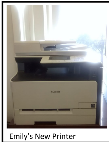
Emily's New Printer