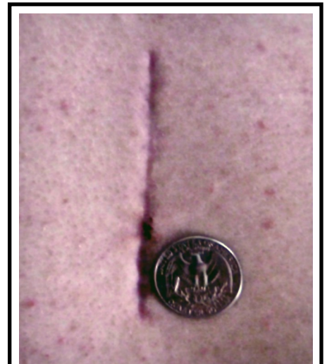
A picture of Nathan's scar next to a quarter.