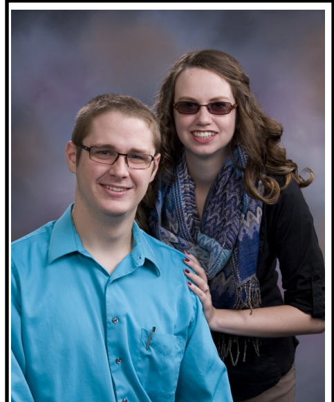
Our RGBM Staff Picture!

God has been enabling me to be a blessing in ministry. We (as a ministry department) currently have the privilege of raising funds for some much needed student housing complexes. There has been a notable increase of families who are coming to study the Bible, and currently we have no room for them to live on campus. Although my role in this project is more of a support role, I have enjoyed the challenge of editing appeals and various ministry updates, keeping up with outgoing mail packets, and sharing in the celebrations during prayer time each morning as we thank God for what he has provided. It has been an encouragement personally to see “first hand” how God has moved the hearts of both believers and non-believers to be a part of this expansion. Please pray that God would continue to use this opportunity to draw many to Himself. God is also using me in my department to be an integral part of learning a new data system that we transferred to at the end of September. Being able to properly organize our data means that we can be better stewards in our responsibilities. Please pray that I would excel further in this new program so that I can enable my department to serve as a very “well oiled machine”.